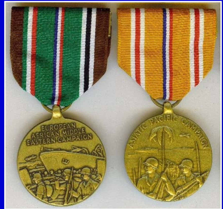
European & Asiatic Campaign Medals